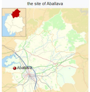
Wall Fort (Aballava)