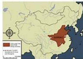
Shang Dynasty 1700-1027

A dynasty is a line of hereditary rulers of a country. This means a person will inherit rule from their parent when they die or abdicate. What other words could we use for dynasty? House, family and clan Locate where the Shang Dynasty was on a map of the world and on class timeline on the working wall.